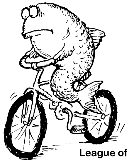
League of American Bicyclists

Please consider renewing for more than one year. This saves us the time and money needed to process a membership, and saves you money since we give you a break on those additional years. This price break only applies to the second and subsequent years that you renew; if you take the break on a one year renewal, we can only renew you for 8 months.