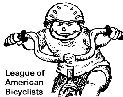
League of American Bicyclists

This story ran on page C1 of the Boston Globe on 6/18/2002. © Copyright 2002 Globe Newspaper Company. Distributed on the internet.