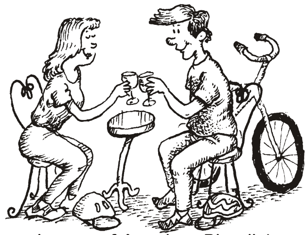
League of American Bicyclists

By now I'll bet that your appetite for cycling the St. Lawrence is whetted so I'll continue on with Day 2 and the rest of the " Tour de Wimpe " in the next Newsletter.