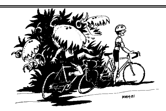
This is a great shortcut! No dogs!

Some restrictions apply, ask for details at the store.