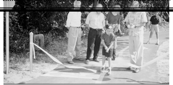
Rail Trail Ribbon Cutting Ceremony

FOR MORE INFORMATION: Send a self-addressed, stamped envelope to: Tour of Sebring, 913 Sumter Road East.